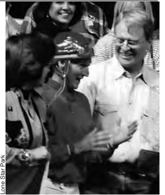
Lone Star Park