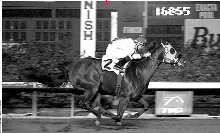
Boy Of Summer, owned by the Painted Pitchfork, crossed the wire first in each of his races during 2003. The gelding has broken two track records, and he continues to deliver more than his owners and trainer ever imagined.

"We are having a great time with him," he added. "In fact, we have had a fun time with all of our Paint Horses. The breed keeps getting better and better all the time."