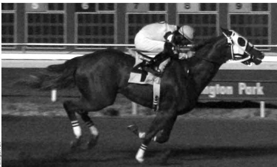
My Name Is Joe earned champion status for the second year in a row and ran his best race of 2003 at the PSBA Derby at Remington Park. "Joe's" lifetime earnings total nearly $100,000.